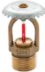
HIZLI TEPKİMLİ 3 mm BULB