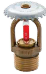
STANDART TEPKİMLİ 5 mm BULB